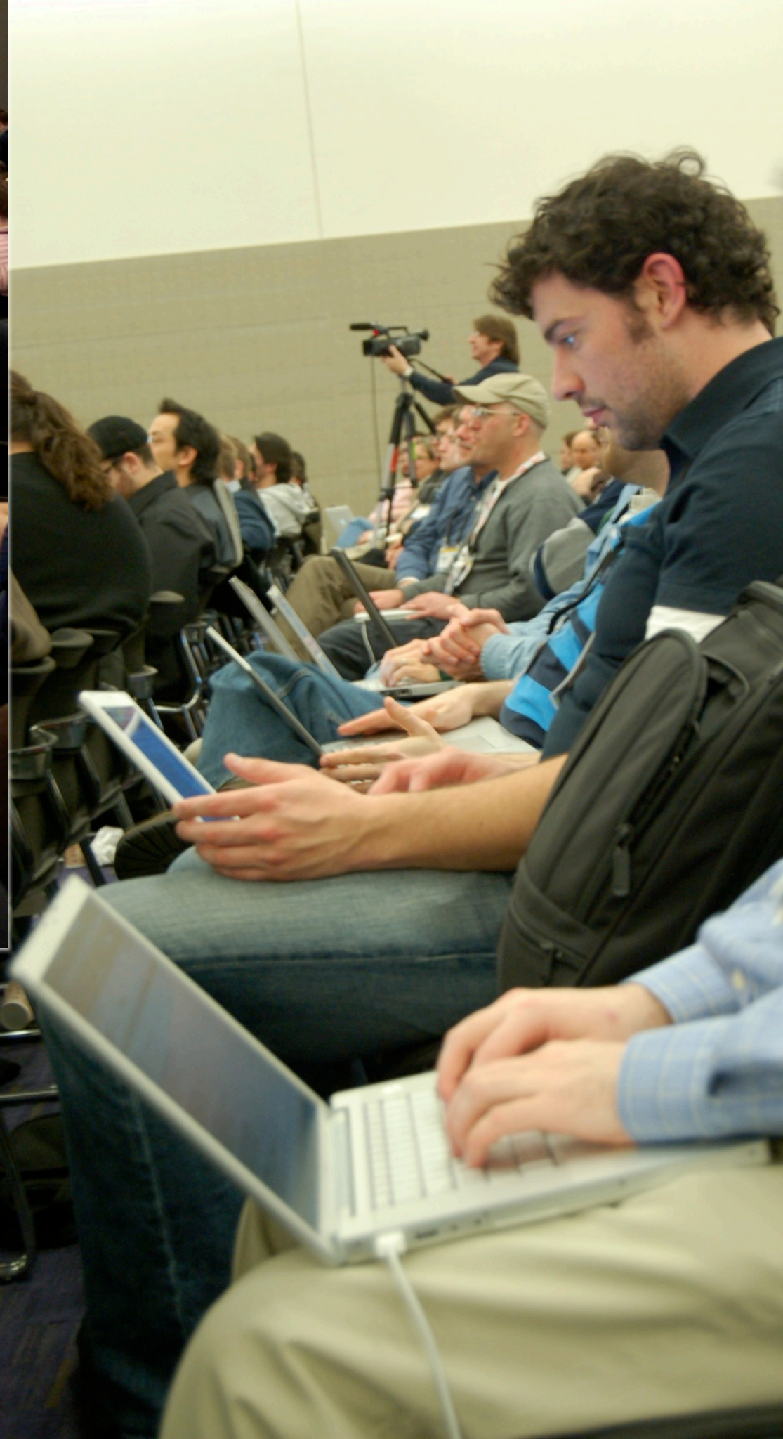
DrupalCon Boston, Spring 2008